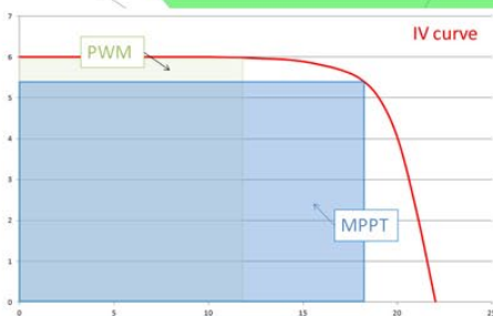
MPPT controller up to 40A